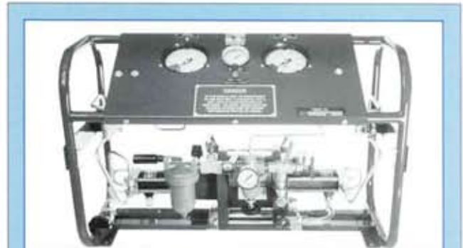
32" long x 14" wide x 24" high Approx. weight: 115 lbs.