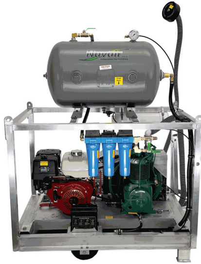
R15 with Volume Tank and Inset Frame Wheelbarrow Style Frame Shown SKU: LP-R15HL