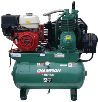
Champion R15 Tank Mount SKU: LP-R15-30T

Champion R15 low pressure compressor with loadless start, head unloaders and hour meter is driven by an electric motor, gas or diesel engine. The Champion R15 package comes standard with an over pressure valve, drain valve, large air after cooler, check valve, gate valves and plumbing. The optional frames are made with 6061 aluminum and have an enclosed bottom, four point lifting or handles and wheels that make them easy to move around the job. All equipment is inset; compressor and engine have independent vibration absorption mounts and are mounted on an aluminum plate.