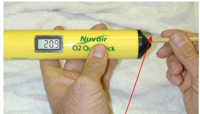
Calibrator Trim Tool Placement